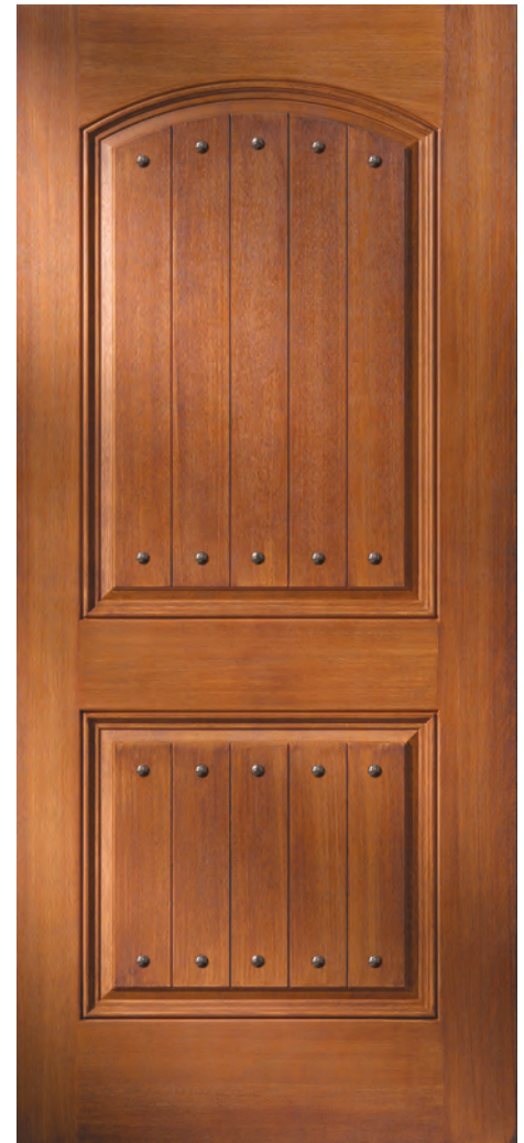
BRK-01 with Clavos (Rustic)